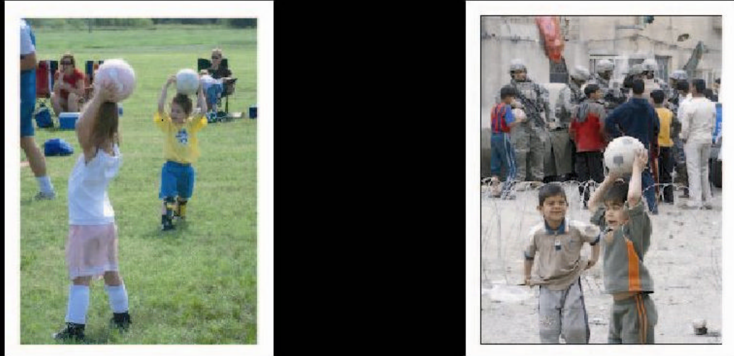
Figure 1. Iraq War slide with neutral picture on the left and Iraq war picture on the right. Veterans looked at the slide for 10 seconds.